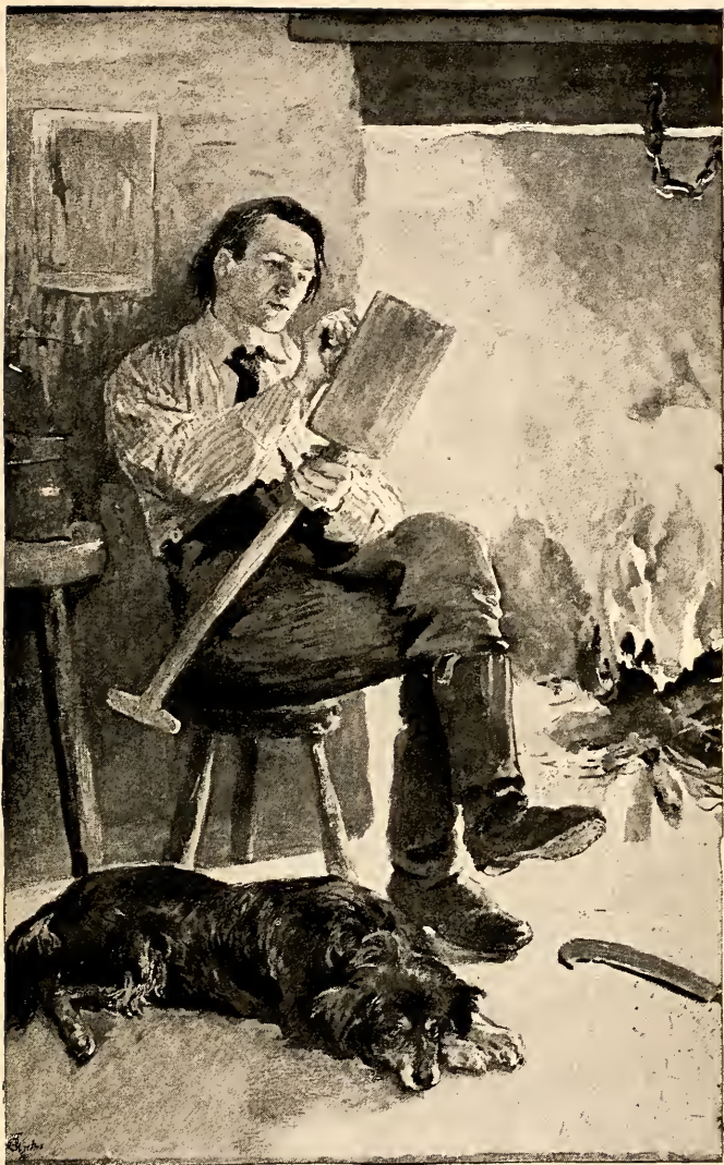
YOUNG LINCOLN WORKING OUT SUMS ON A SHOVEL